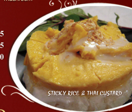
STICKY RICE & THAI CUSTARD

Shrimp & scallop, sautéed with curry powder, onion, bamboo shoot, bell pepper, and mushroom