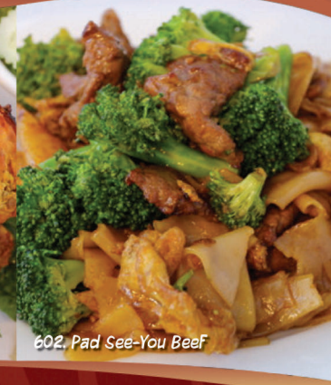
602. Pad See-You Beef