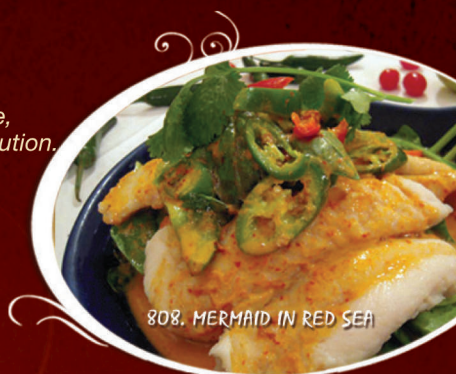
808. MERMAID IN RED SEA

Steamed or Fried fillet of Sole and spinach topped with red curry sauce