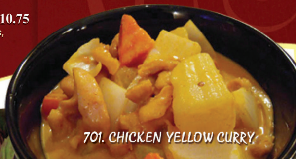
701. CHICKEN YELLOW CURRY

Chunks of pumpkin, peas, and carrot in red curry sauce