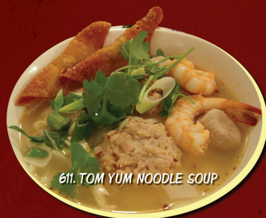
611. TOM YUM NOODLE SOUP

Soupless egg noodle, BBQ pork slices, bean sprout, cilantro, green onion, and crispy wonton.