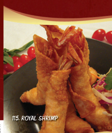
115. ROYAL SHRIMP

FREE DELIVERY $15.00 minimum order within 3 mile radius