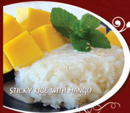
STICKY RICE WITH MANGO

STICKY RICE WITH MANGO $7.75 STICKY RICE & THAI CUSTARD $4.75 LYCHEE IN SYRUP $4.50