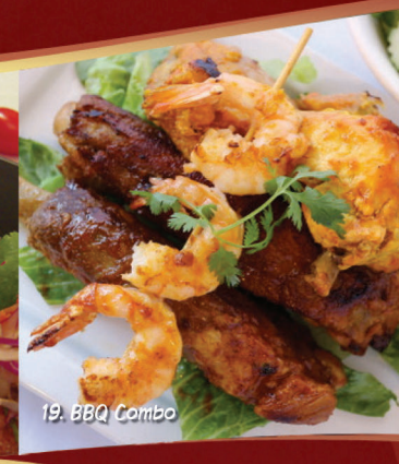
19. BBQ Combo