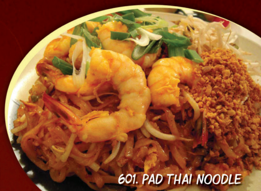
601. PAD THAI NOODLE

Flat noodle pan-fried with shrimp, ground peanut, egg, green onion, and bean sprout